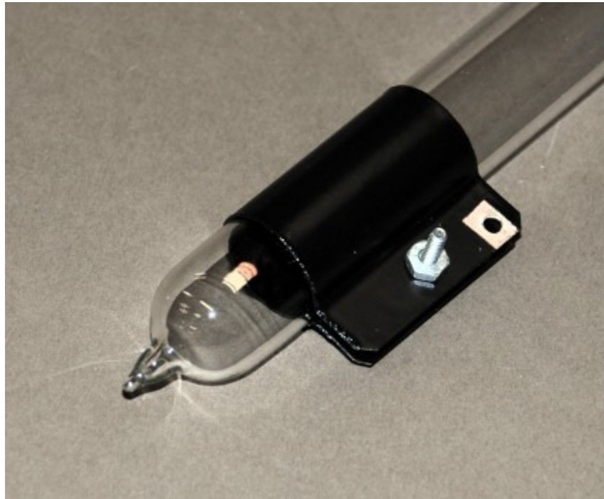
Type E1 electrode for SSQ-PT plasma tube.